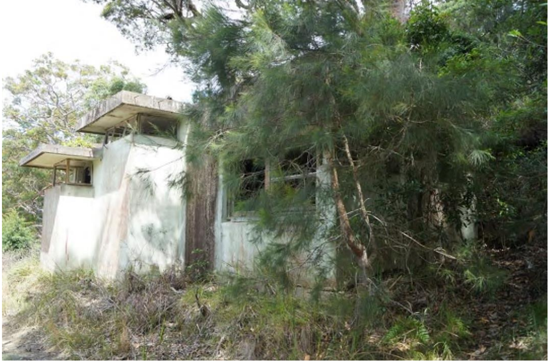
Command Detonated Mine & Indicator Loop Control Post at Midway, Juno Point, 2014

Prepared by David Scobie Architects August 2016